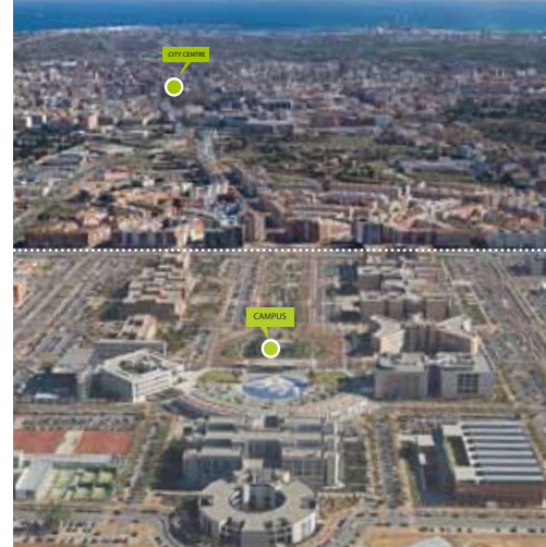
AIR VIEW OF THE CAMPUS AND CASTELLÓN